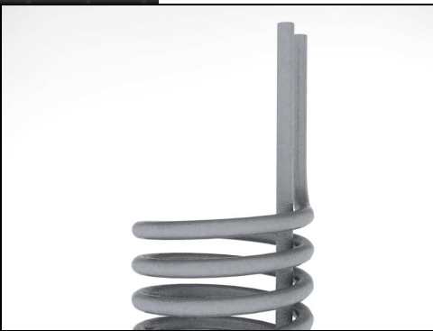
Side-view Cooling Coil